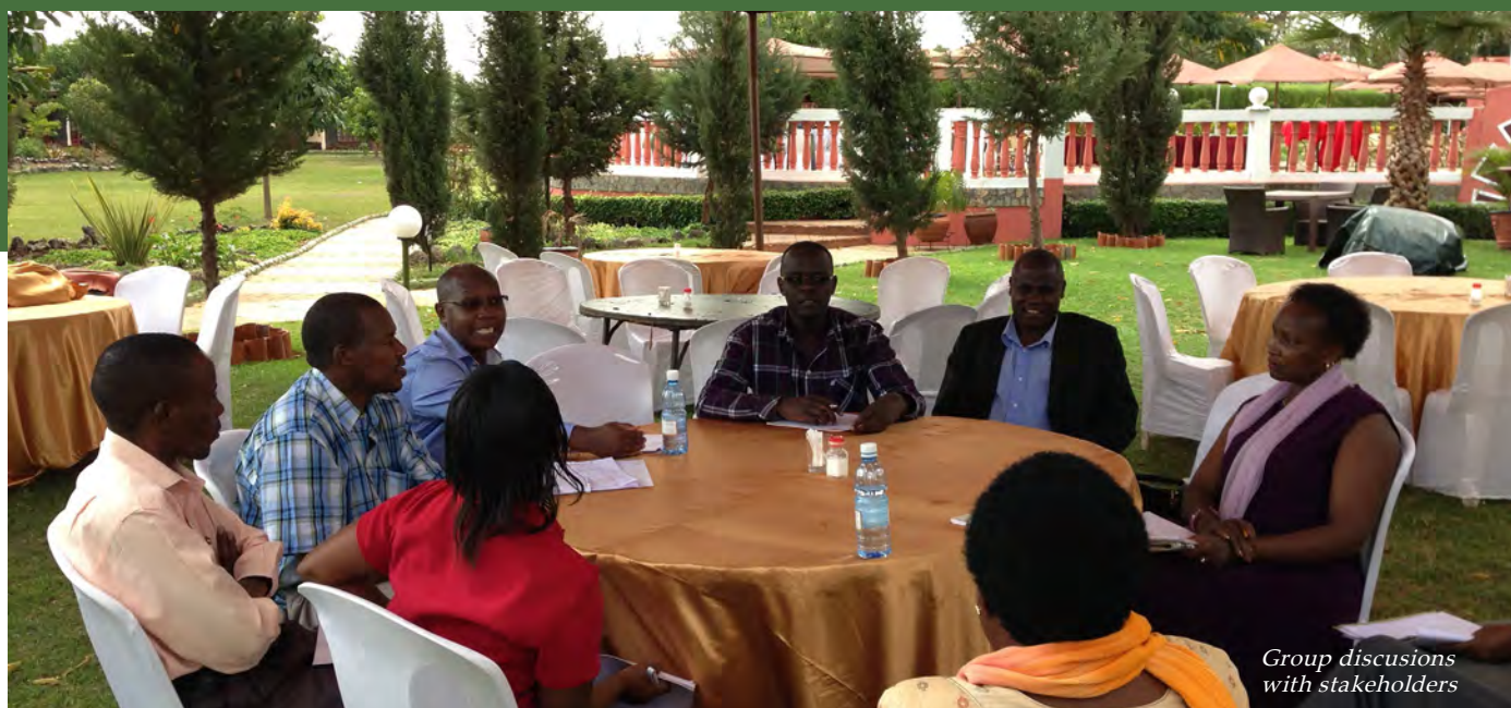
Group discussions with stakeholders

located in the nearby shopping area. In addition to the shop, Kalimoni also sell their produce through a basket scheme, as well as they organise organic farmers markets together with other farmers.