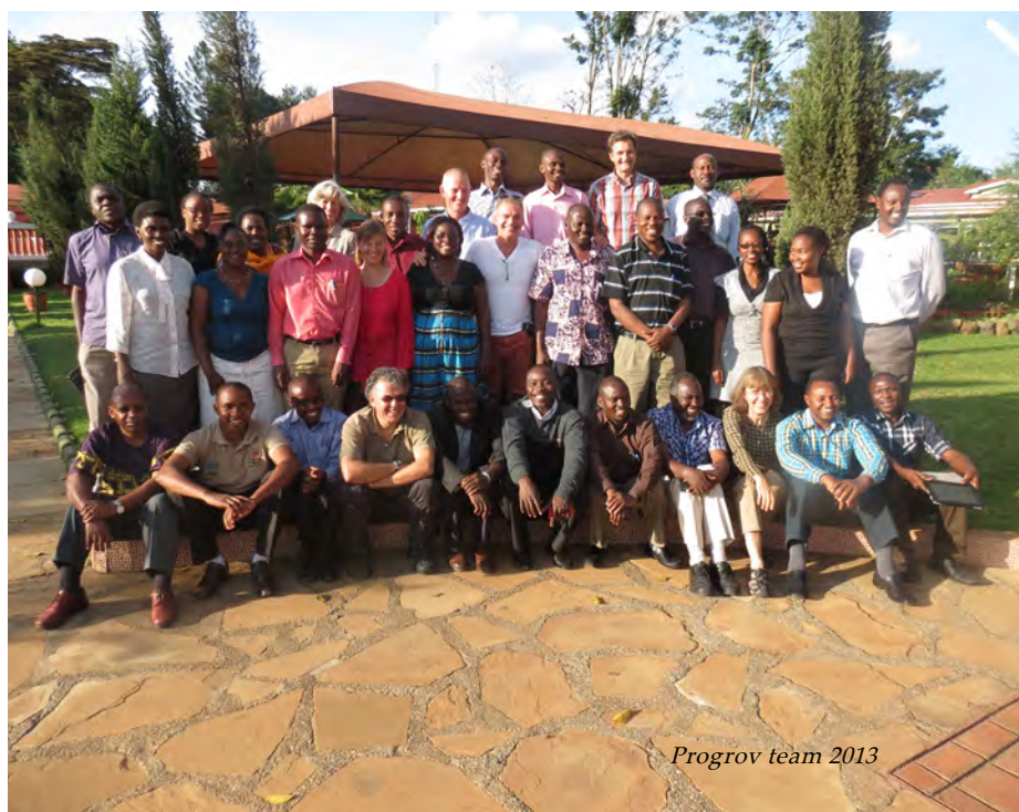
ProgrOV team 2013

to development. This was experienced at first hand through the stakeholder workshop and visits to the farmers' fields. The group experienced that sharing knowledge with stakeholders in the various steps of the value chain was inspiring and helped ensuring that the work of the students was on the right track.