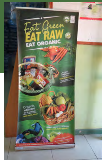
Kalimoni Greens Shope in the shop- ping area

sages across and understood by stakeholders.