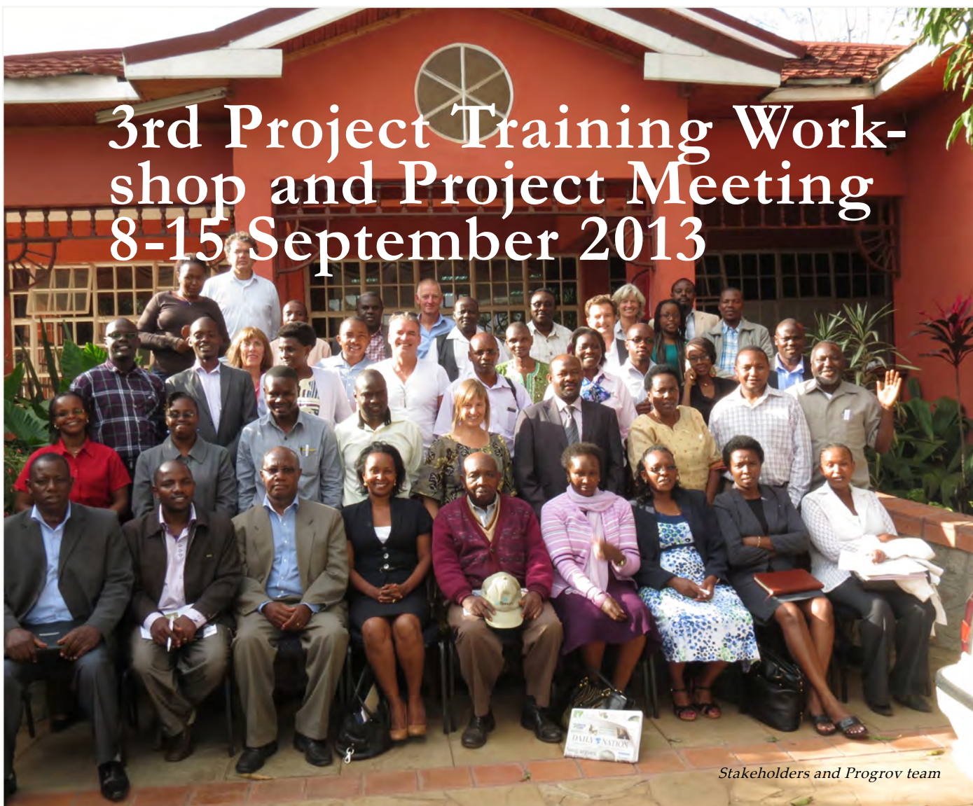
Stakeholders and ProgrOV team