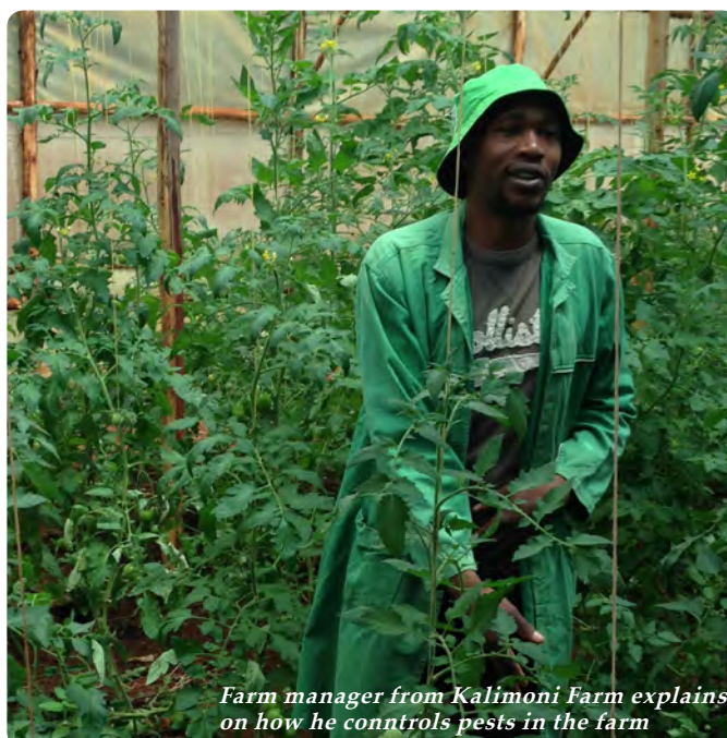
Farm manager from Kalimoni Farm explains on how he controls pests in the farm